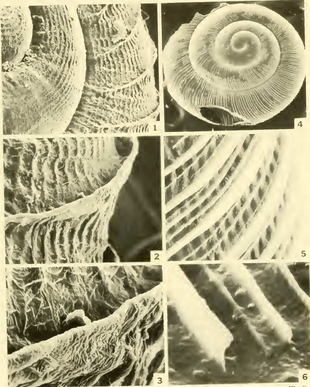
FIGS. 1-3. Striatura ( Pseudohyalina ) exigua (Stimpson, 1850). Ohio. FMNH 11020. FIG. 1. Apical (left) and post-nuclear (right) sculpture. 185X. FIG. 2. Sculpture on body whorl showing one major radial rib. 620X. FIG. 3. Detail of periostracal surface on major rib. 1,850X. FIGS. 4-6. Punctum

ing to buttress the apical side of the microradial. This is particularly evident in Ptychodon micro-undulata (Solem, 1970: pl. 59, fig. 10), but is much less developed in Radiodiscus (figs. 9, 10). Be-